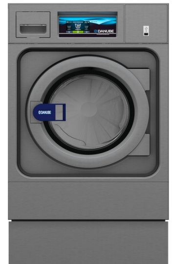
WPR + plinth